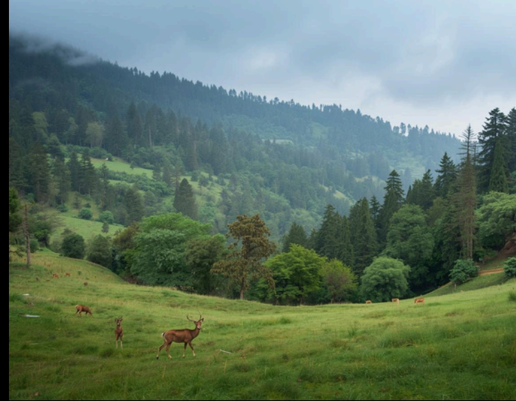
Kalatop Khajjiar Wildlife Sanctuary